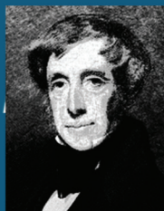
Clement Clarke Moore was born on July 15, 1779, in New York City. He was the author of Poems (Barlett & Welford, 1844), which included the poem “A Visit from St. Nicholas.”

On December 23, 1823, a poem called “A Visit from Saint Nicholas” was published anonymously in the Sentinel , the local newspaper of Troy, New York. This piece offered a different take on Santa Claus, a figure who was, until that time, traditionally depicted as a thinner, less jolly, horse-riding disciplinarian, a combination of mythologies about the British Father Christmas, the Dutch Sinterklaas, and the fourth-century bishop Saint Nicholas of Myra. But the poem in the newspaper painted a different picture: it gave Santa eight reindeer, and even named them; it described a Santa who could magically sneak in and out of homes via chimneys; and it created the venerated, cheerful, chubby icon that is everpresent in holiday cards, movies, television shows, and malls everywhere. The poem, of course, is now known as “’Twas the Night Before Christmas,” after its famous first line. Thirteen years after it was published, Clement Clark Moore took credit for its authorship, though his claim to the poem is now in question. Many believe the poem was actually penned by New York writer Henry Livingston.