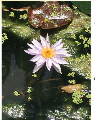
MCKEE BOTANICAL GARDENS

Celebrate the essence of this historic Garden during the 19th Annual Waterlily Celebration and enjoy one of the state's largest collections of waterlilies at McKee Botanical Garden. Waterlilies have been McKee's most striking plant collection since the 1930s. During the warm summer months, the lilies bring vibrant color in flowers and leaves and fragrance and texture to the ponds and streams. Enjoy repotting demonstrations, plein air artists creating beautiful works of art, plant vendors, and the annual waterlily photo contest. For more information, visit their website!