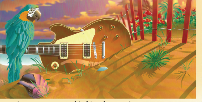
Musical entertainment is part of the fabric of Vero Beach.

car shows throughout the year. Chill out in the shade, sip some wine, and enjoy the natural beauty, and country charm, of a this scenic vineyard with friends and family.